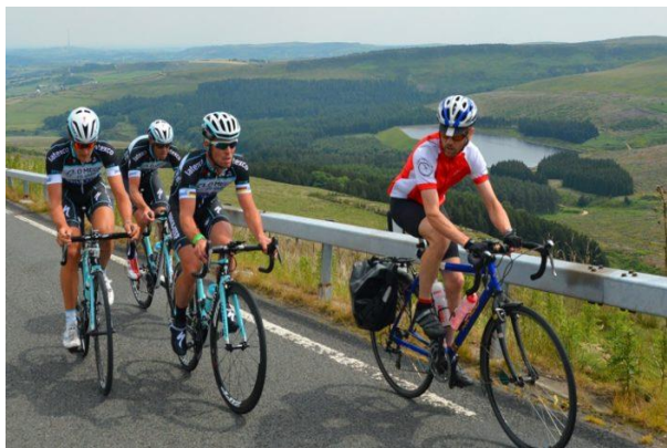
Not me, but one of my Fujitsu colleagues gets passed by Cav et al on Holme Moss

My most memorable brushes with fame have though come whilst out on my bike. In 2014 my employers hosted their own cycle sportive: The Tour de Fujitsu over the fifty miles between our offices in Wakefield and Manchester along most of the roads that were to form the Grand depart of that years Tour de France which was heading out from Yorkshire. There were about 200 riders in our event and based on anticipated finishing