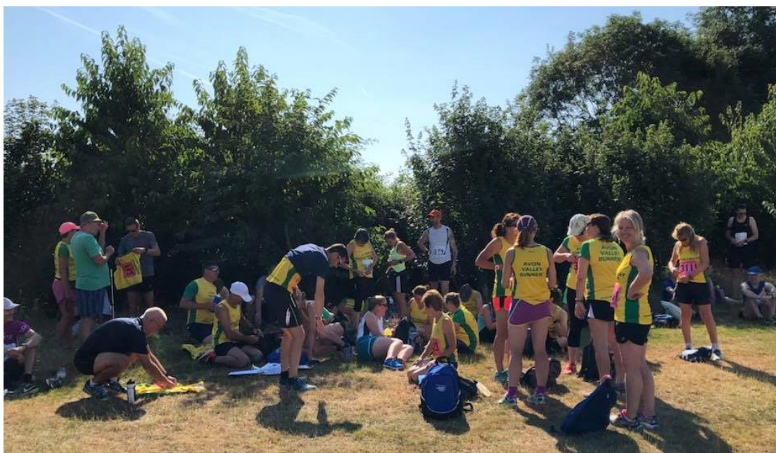
AVR keeping cool in the shade at the Bath Two Tunnels race - the multiple race waves meant some runners had finished their race before others had even begun.