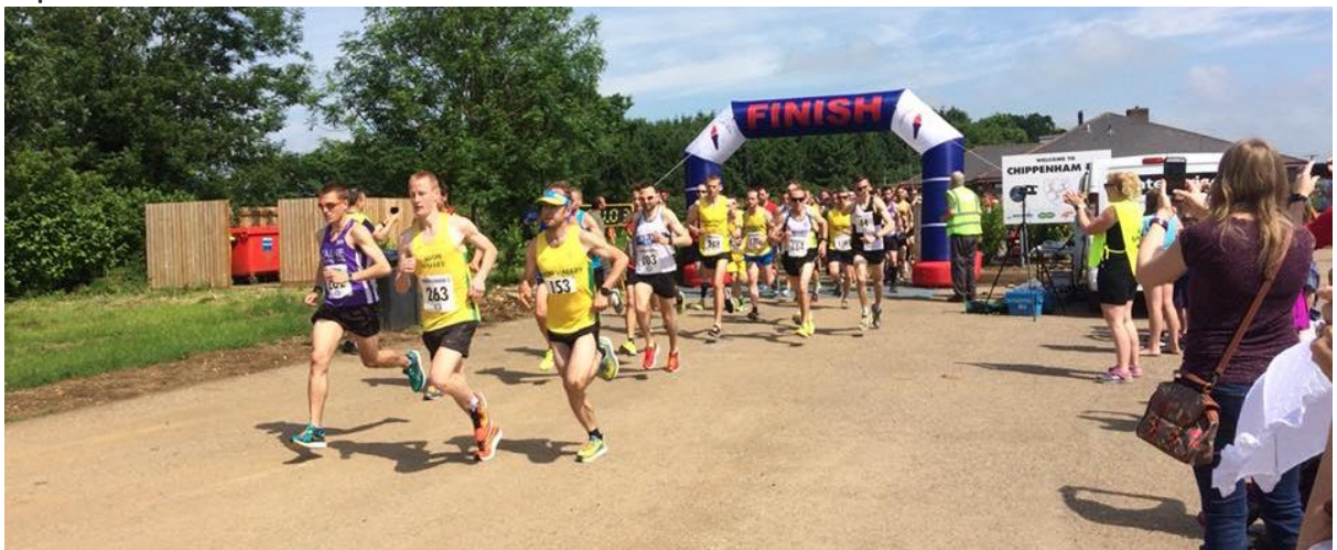
And it's "GO" at the start of the Chippenham 5.