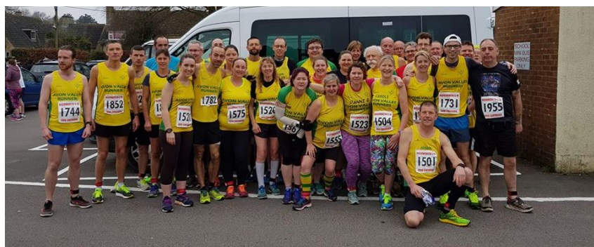
AVR Primed for the season ahead at Highworth 5mile.